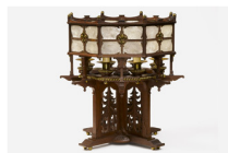
Charles Rohlf's Fantastical Furniture

Sign up for the ELLE DECOR weekly newsletter