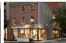
Building on the Past