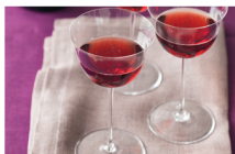
ELLE DECOR's Guide to Entertaining with Wine the Perfect Party