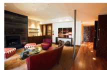
Entertaining with Wine